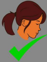
Long Hair should be tied up