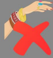
No Jewellery (except with Senior Award Privilege)