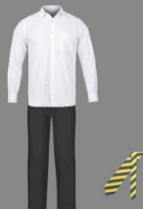
White shirt with green/gold tie and grey or black trousers