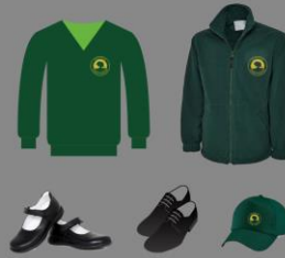
Green jumper, fleece and cap with logo Plain black shoes (no logos)