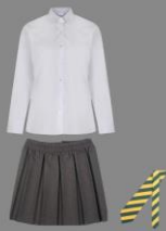
White shirt and green/gold tie with a grey or black Knee length skirt