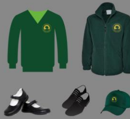
Green jumper, fleece and cap with logo Plain black shoes (no logos)