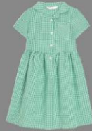
Green & White Summer Dress