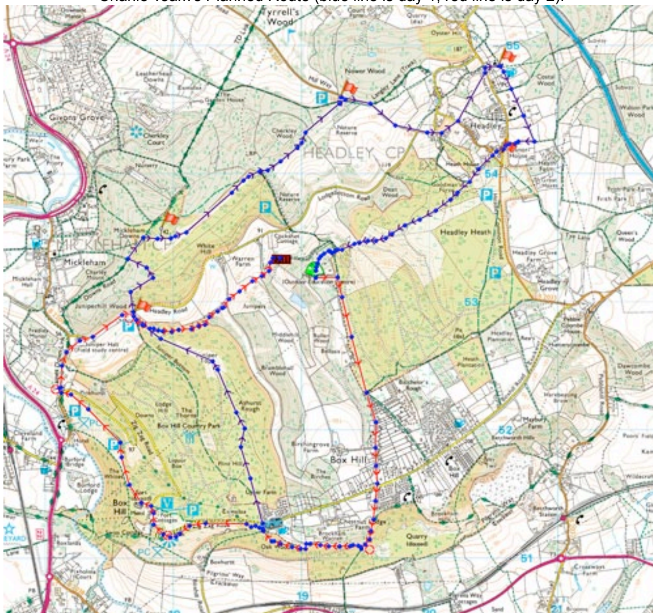
Charlie Team's Planned Route (blue line is day 1, red line is day 2):

Our thanks also go to the Catering department who provided an excellent selection of snacks and drinks for the students to take with them on the expedition.