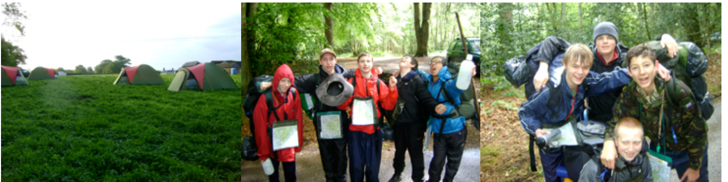
Alpha Team's Planned Route:

Our thanks also go to the Catering department who provided an excellent selection of snacks and drinks for the students to take with them on the expedition.